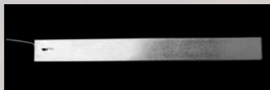
10008 Breaker Bar Assembly

Cato has been providing the quality Chief fire extinguisher cabinets since 1984 and is the world's largest manufacturer of plastic fire extinguisher cabinets and protective covers. The Chief cabinets protect the extinguisher from weather and any ambient conditions that might jeopardize its use. The elimination of metal reduces the chance of personal injuries and reduces the possibilities of product liability insurance claims. The unique design of the Chief cabinets also reduces vandalism and theft.