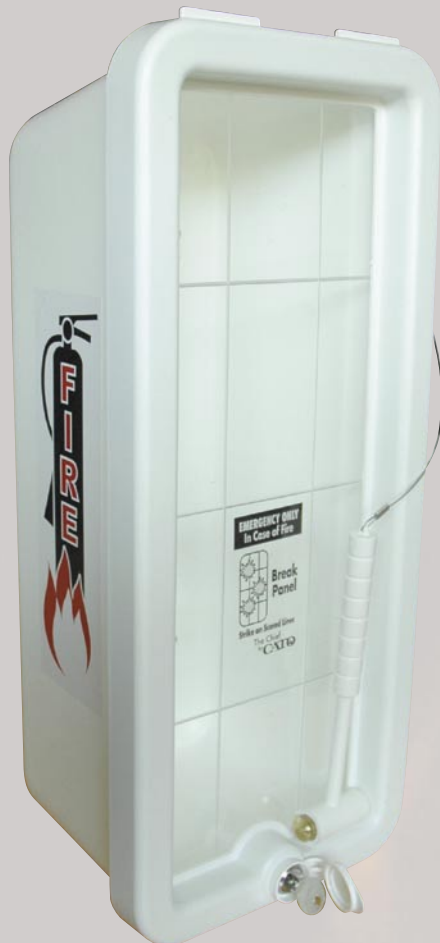
Chief 105-5 WWC-H