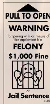
CL-416 Pull Panel Label