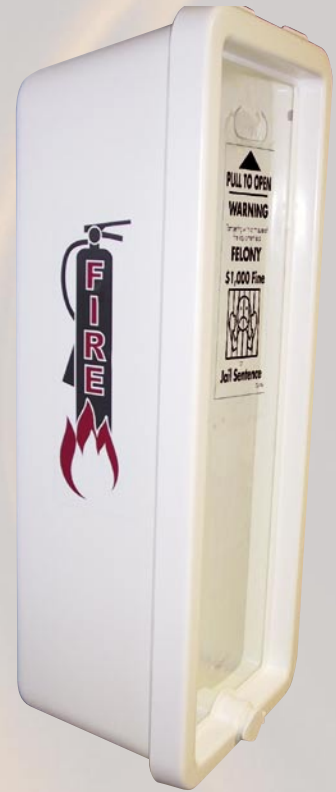
Island Chief w/ clear pull panel "Tampering is a Felony" label 5 or 10 lb. extinguisher sizes.

White frames shipped with white protective lock covers.